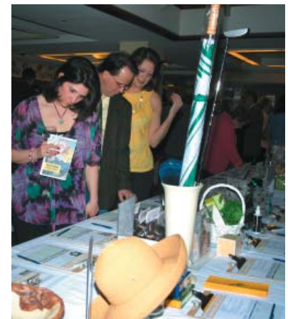
Placing Auction Bids