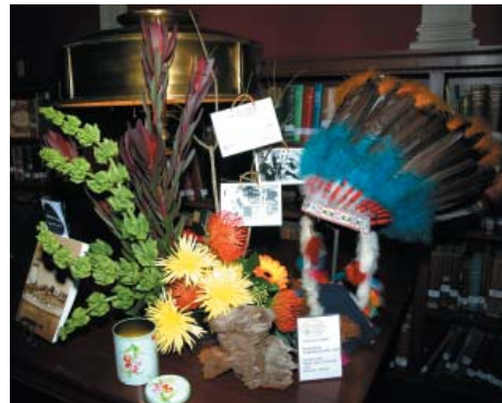
Homage to Pleasure Island