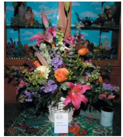
Floral arrangements were raffled