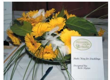
Make Way for Ducklings

Our sincere thanks to all who donated auction items, delicious hors d'oeuvres, fine wine, fabulous floral arrangements and especially their time, creativity and enthusiasm to the success of this special event.