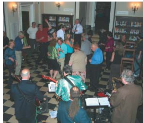
Dancing to Rent Party