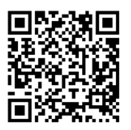
Donate to the Friends of Beebe Library

I fondly recall the sense of pride and responsibility I felt when I was issued my first library card as a child. A whole new world was opened to my young eyes. We all love and appreciate the dedication that has made our library the welcoming respite for so many loyal patrons. It is wonderful to see patrons take refuge from extreme heat or cold spending hours reading and using Wi-Fi in the many comfortable nooks throughout the building. Our chil-