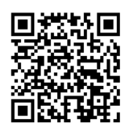
Join the Friends of Beebe Library